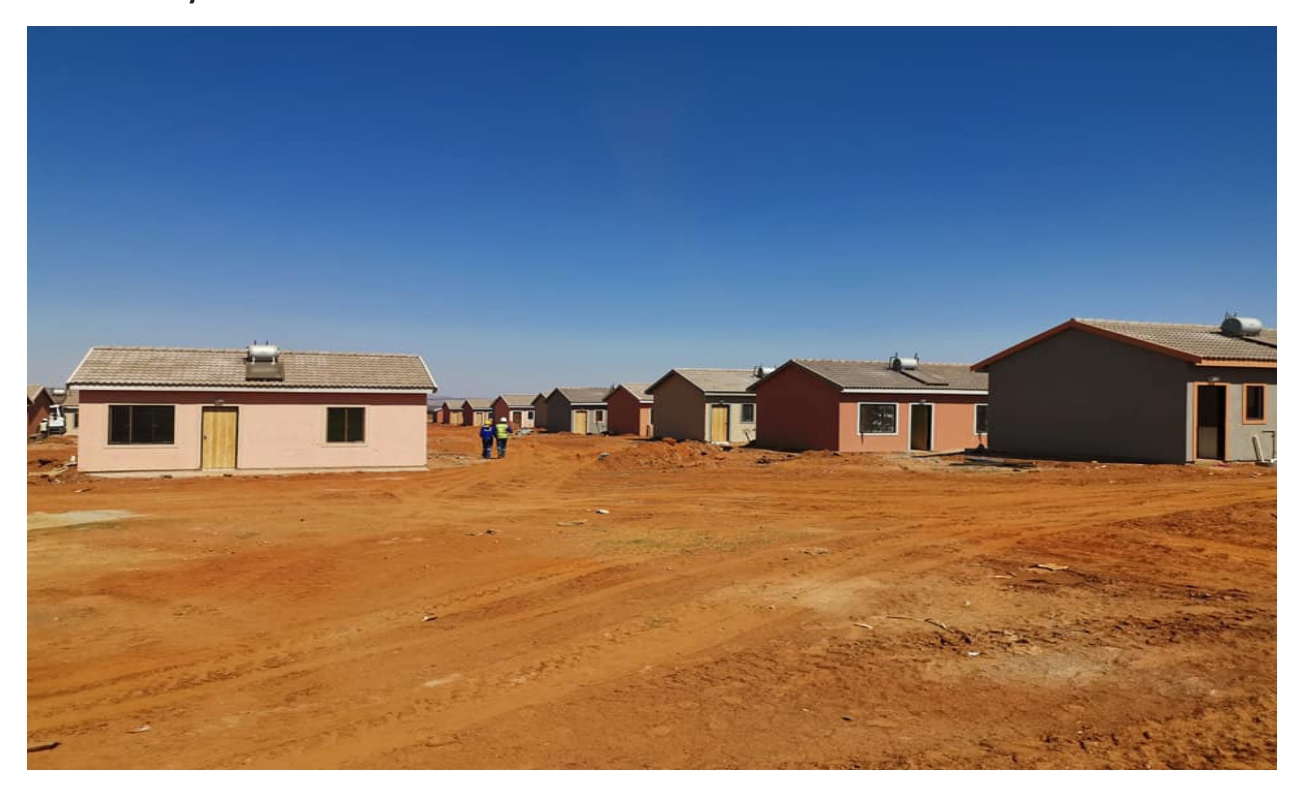
Kagiso Ext. 13