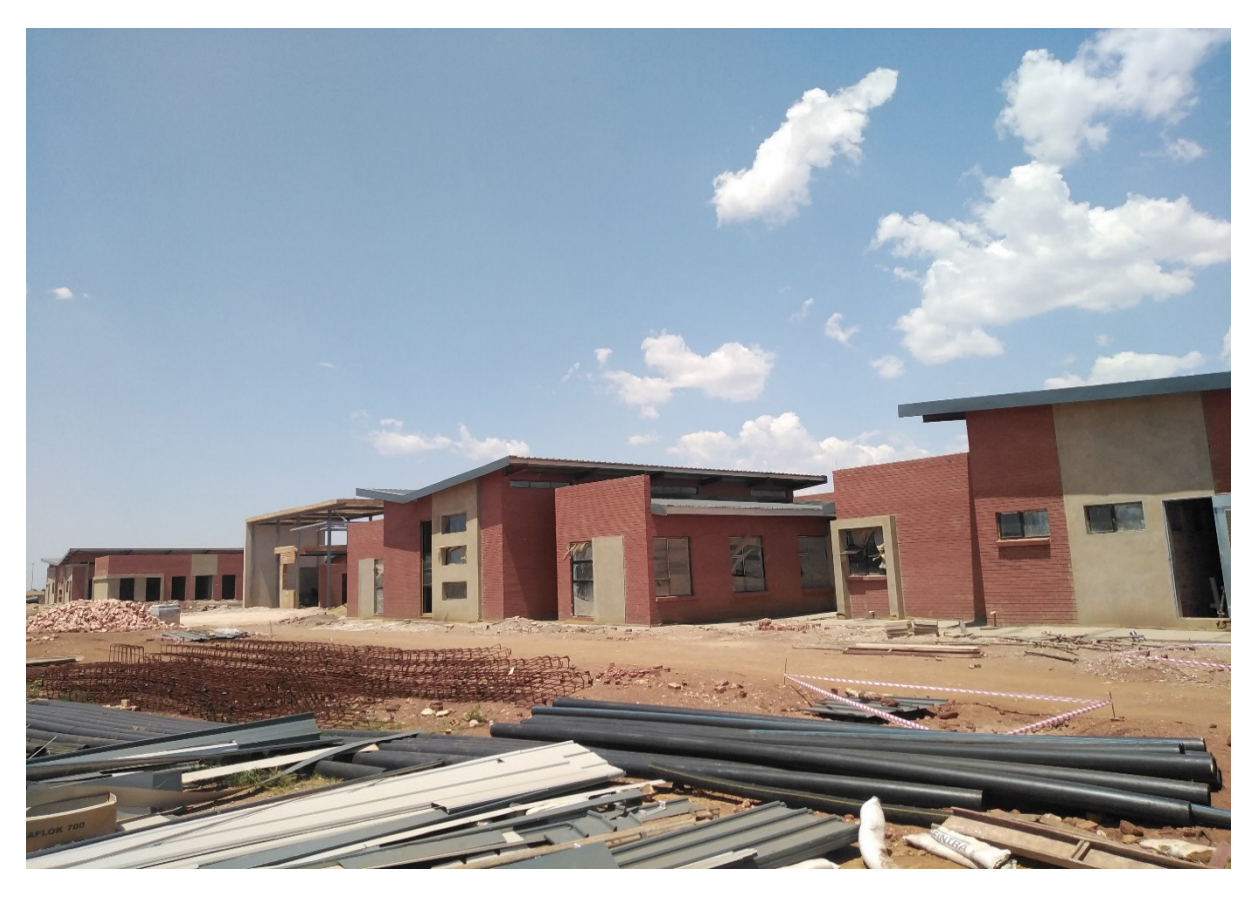
Garankuwa Rearabilwe Office Accommodation